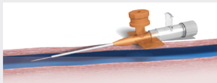
Placing the catheter

Adapt flexible to the particular vein in terms of energy, power and approach.